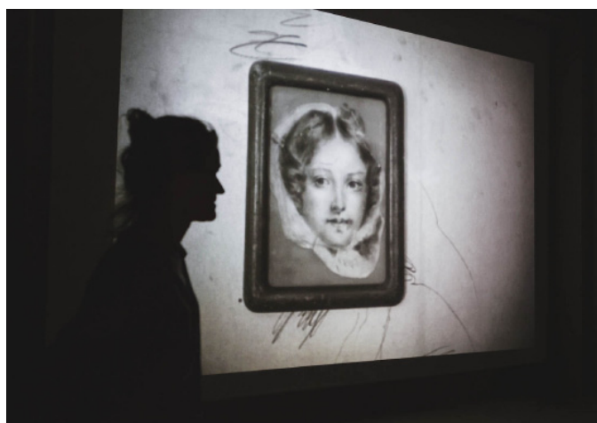
Open Show - Paris - 2014