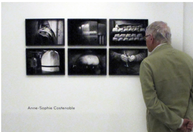
Musée de la photographie de Charleroi - 2009