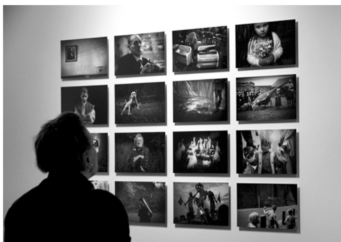
Stadtmuseum - Kaiserslautern - 2015