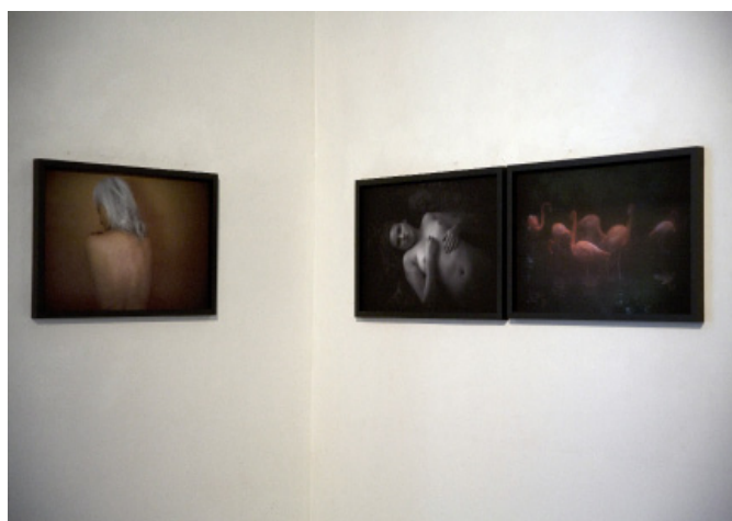
44 Gallery - Bruges - 2016