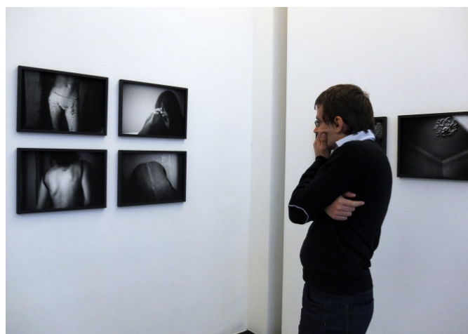
Musée de la photographie de Charleroi - 2012