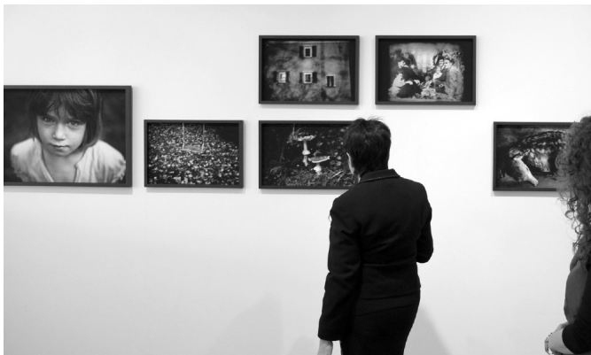
Cultuur Centrum - Hasselt - 2014