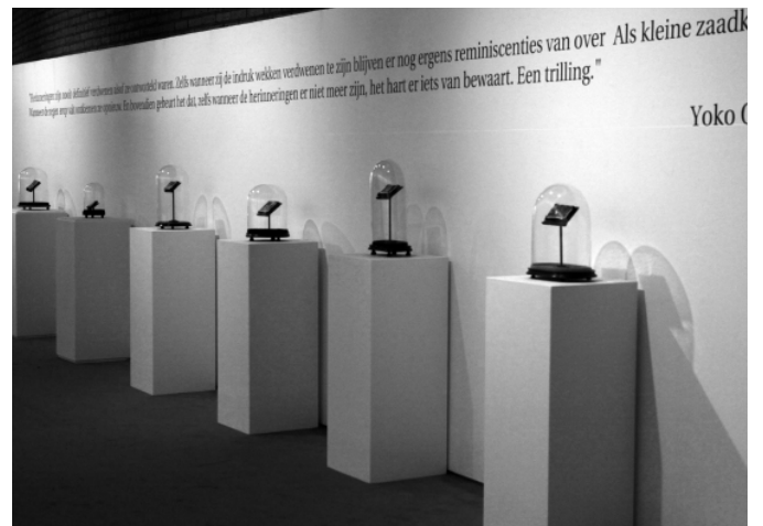
Cultuur Centrum - Hasselt - 2014