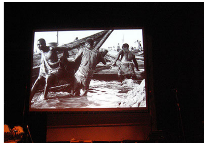
Biennale de la photographie - Bamako - 2007